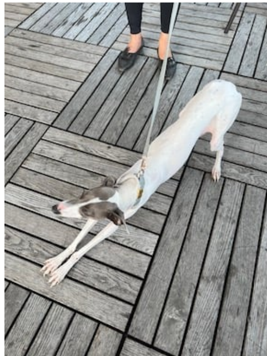
My dog Juneau enjoying her pool, and Jack the Whippet stretching after his meal.